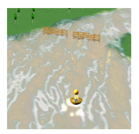
Figure 4: A Dam Blocking the Exit

The primary vehicle for moving the character is a coracle. This means of transport fits well into the lake environment and interfaces smoothly with Wii Balance Board and Wii Controller. The controller is used for rowing action which propels the coracle forward, while direction is altered by leaning left and right on the Wii Board. This routine, which increases physical activity, has also been used in its own right for a mini-game when the player travels between lakes. To go from one lake to another a player is required to sail down the river full of obstacles (stones, logs, whirlpools) and try to collect bonuses which can later be used on the islands, or increase score (Figure 5).