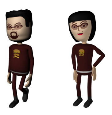
Figure 6: The Villains

Healthy eating messages had to be incorporated subtly, so as not to distract from the main gameplay. The first, simple idea is to place short and relevant text tips onto the loading screen. The second idea, actually, defined the story of the game. As a young sorcerer, the player is required to deliver food packages to the famine struck islanders, while two villain characters (Figure 6), for nefarious reasons, are slipping in unhealthy food in an attempt to make islanders overweight. The player needs to eliminate these unwanted packages. Two pedagogical issues had to be taken into account. Firstly, the main character cannot be modified to look overweight. Secondly, the player is not allowed to fight the villains directly.