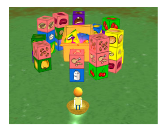
Figure 8: Blocks Used in a Level

In general, packages are separated into six categories according to food group division (e.g. dairy products, fruit, and vegetables) with one category being unhealthy food (Figure 8). Packages of each group are colour coded, reducing confusion. One of five food group members is represented on a package (e.g. fruit package would be green and could have cherries depicted on it) giving the total of 30 distinct packages.