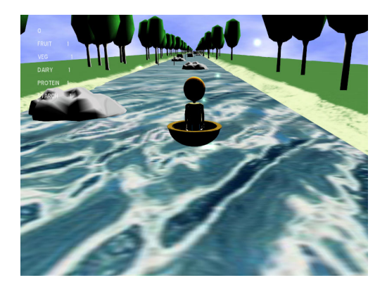
Figure 5: The River Minigame

The primary vehicle for moving the character is a coracle. This means of transport fits well into the lake environment and interfaces smoothly with Wii Balance Board and Wii Controller. The controller is used for rowing action which propels the coracle forward, while direction is altered by leaning left and right on the Wii Board. This routine, which increases physical activity, has also been used in its own right for a mini-game when the player travels between lakes. To go from one lake to another a player is required to sail down the river full of obstacles (stones, logs, whirlpools) and try to collect bonuses which can later be used on the islands, or increase score (Figure 5).