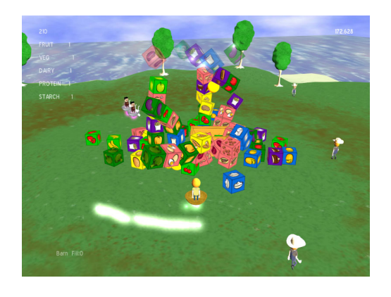
Figure 7: An Island Level

senting the gameplay on one of the islands is shown in Figure 7.