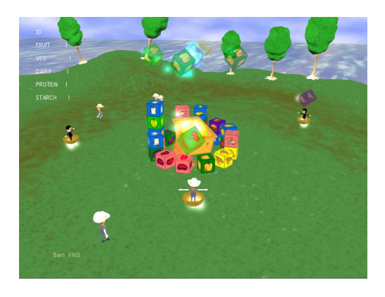
Figure 1: The Game's Art Style

The targeted age group governed the choice of the art style, shown in Figure 1, which can be described as cartoony. Characters, environment and even animation are exaggerated with a simple yet vivid colour scheme full of contrast. All edges are accentuated by hard black lines. This style is not only appealing to children but it also accelerates development by reducing time required for modelling, texturing and animation, as less precision and realism is needed. In addition, it should help keep children's concentration as no distraction is created by unnecessary details.