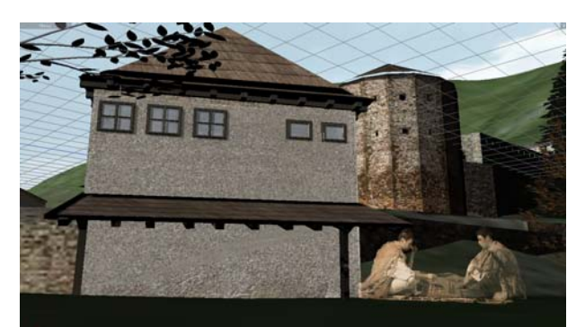
Figure 7: Real avatars embedded into the VE using Quest3D

X3D demands better understanding of the VRML standards and programming techniques, but offers the expected result. The navigation through the environment is slower even though the same image textures were used in both examples.