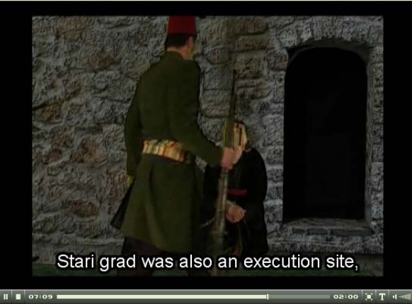
Figure 2: The scene of invading the Fortress

The user is guided trough the story by a narrator and the experience is enhanced with different language versions of the narration and music background which was created using the traditional Ottoman music as an inspiration. Figure 2 shows a screenshot from the movie.