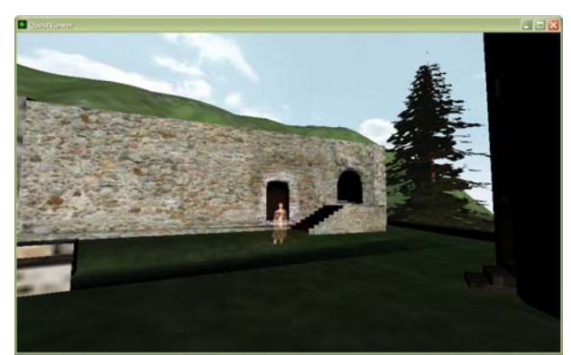
Figure 6: Real avatar embedded into the VE using Quest3D

users with no programming experience. The published outcome (software supports different output formats) is a very fast and realistic standalone environment created using a very friendly user interface. Quest3D cannot perform the complete real-time keying, which can be noticed when the image texture with alpha channel is applied. Movie texture applied to a plane is blended with the environment and is slightly transparent (Figures 6 and 7).