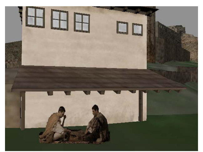
Figure 9: Real avatars embedded into the VE using X3D

The main drawback of both methods lies in losing the third dimension of the avatar (Z axes). Thus, the user cannot have a side view of the object containing avatar.