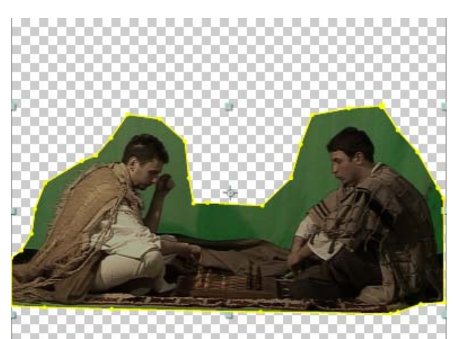
Figure 4a: Video footage before keying

Figure 4a shows the video material with the garbage mask applied to remove the unnecessary environment and the final result of the keying process (checker background illustrates transparency - Figure 4b).