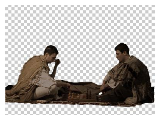
Figure 4b: Keyed video footage

Videos have the Hue/Saturation values adjusted based on the values of the background environment. This way, the real avatars blended better to the real time virtual environment.