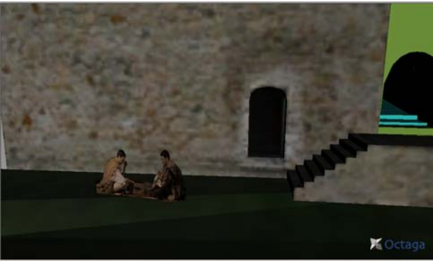
Figure 8: Real avatar embedded into the VE using X3D

X3D demands better understanding of the VRML standards and programming techniques, but offers the expected result. The navigation through the environment is slower even though the same image textures were used in both examples.