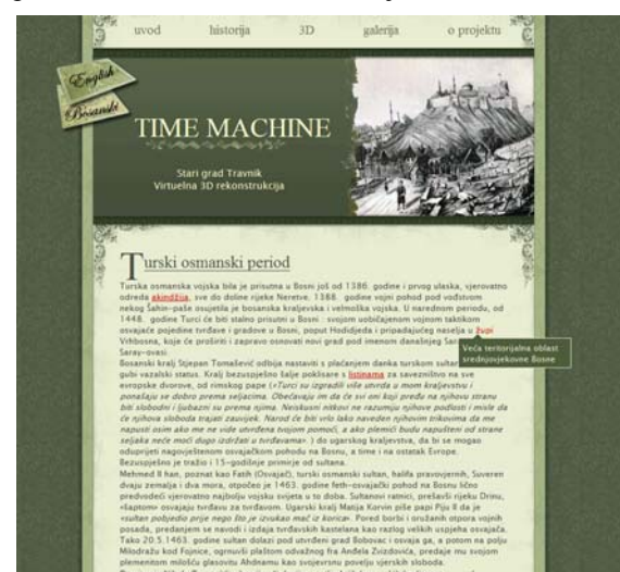
Figure 1: Home page of the project

The Fortress "Old Town" in Travnik represents one of the most beautiful and most preserved facilities of medieval Bosnia, on which the later historical periods left their specific marks. Reconstruction of the photorealistic look of the fortress has the final outcome in form of a user-friendly, multimedia interface (Figure 1) that provides a comprehensive user experience and raises the awareness about cultural and historical importance of the reconstructed object.