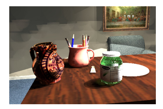
Figure 5: The High Fidelity Render of the Jug Model in a Scene Generated in Radiance

When this technique was being developed, Radiance (version 3.5) was not capable of mapping textures onto