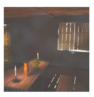
Figure 1: A High Fidelity Render of a Medieval House

This paper is concerned with facilitating and simplifying the process necessary for conversion from the VMRL 1.0 format files produced by a Minolta 910 laser scanner to formats that can be understood by Maya and Radiance. In Section 2 we look at the existing software and the file formats under consideration. Section 3 explains how the sample data was collected and then section 4 describes the conversion process employed to convert VRML files to Maya and Radiance files. Results of the work are in Section 5 and our conclusions are presented along with avenues of further research in Section 6.