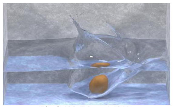
Fig. 3 - [Enright et al. 2002]

For deeper comprehension and study of the Navier-Stokes equations we address the reader to any standard book of fluid mechanics [Caffarelli et al. 1982] or to the official problem description [Fefferman 2000].