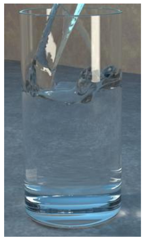
Fig 5 - [Enright et al. 2002]