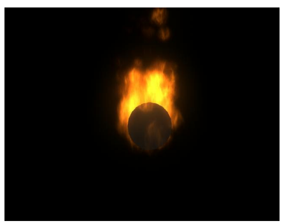
Fig. 7 – Cylinder Polygon with fire (side view)