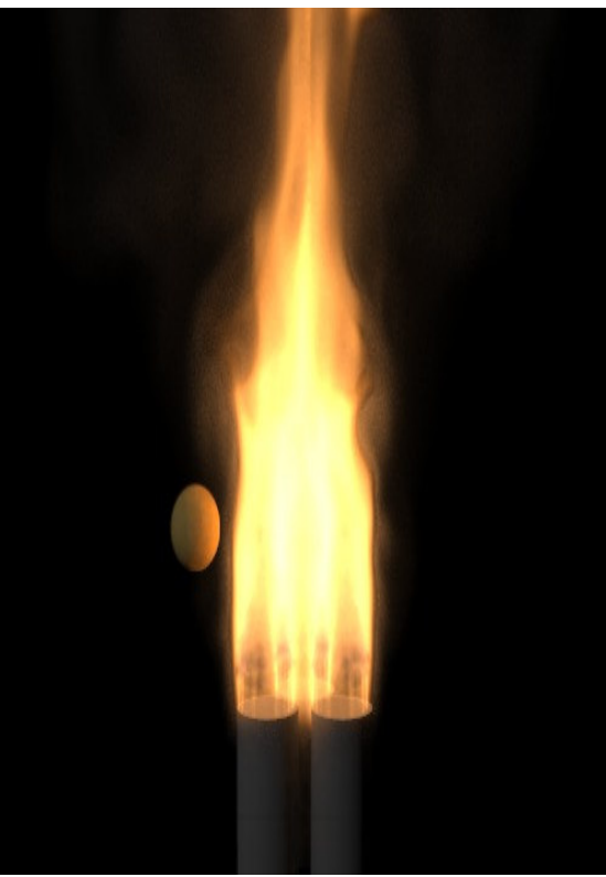
Fig. 6 - [Nguyen et al. 2002]