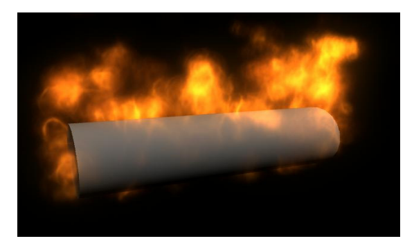
Fig. 1 – cylinder polygon with fire (perspective)

Then the motivation is presented to model water and fire, a survey is made over the applications and importance of modeling this phenomena.