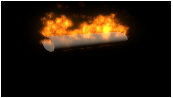
Fig. 9 – Cylinder surface with fire (perspective)