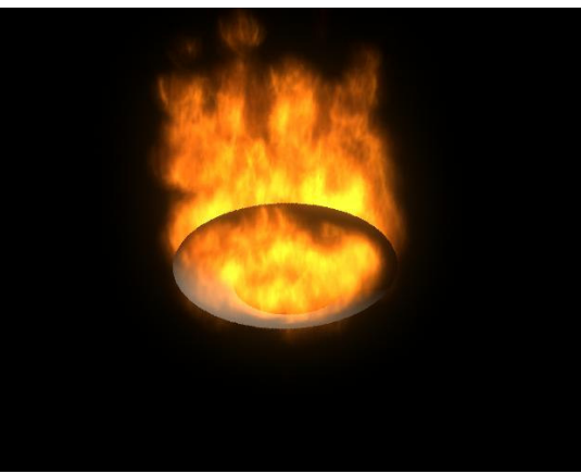
Fig. 8 – Cylinder surface with fire (side view)